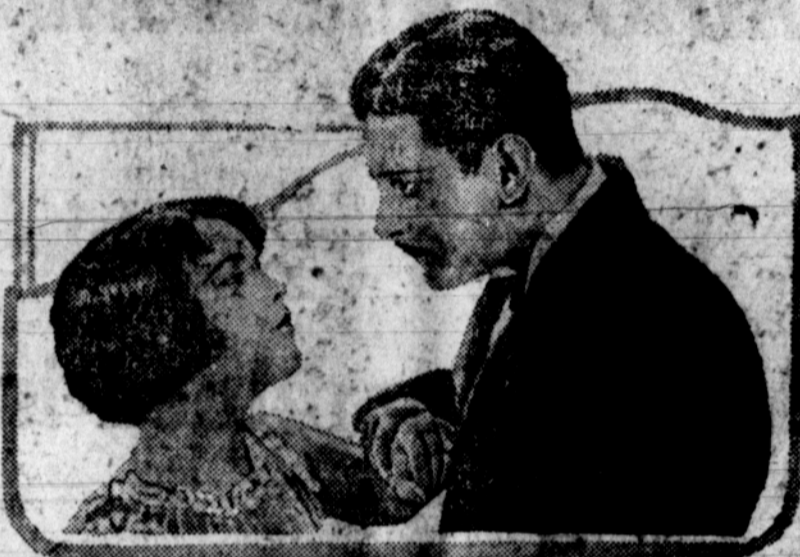
Scene from "ROSE OF THE WORLD" A WARNER PHOTOPLAY