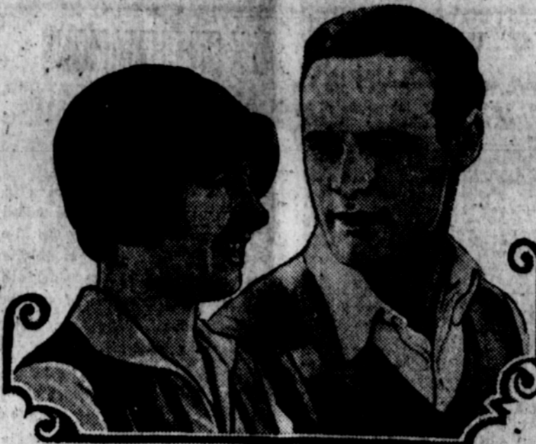
LOIS MORAN AND ALLAN SIMPSON IN THE ALLAN DWAN PRODUCTION 'PADLOCKED' A PARAMOUNT PICTURE