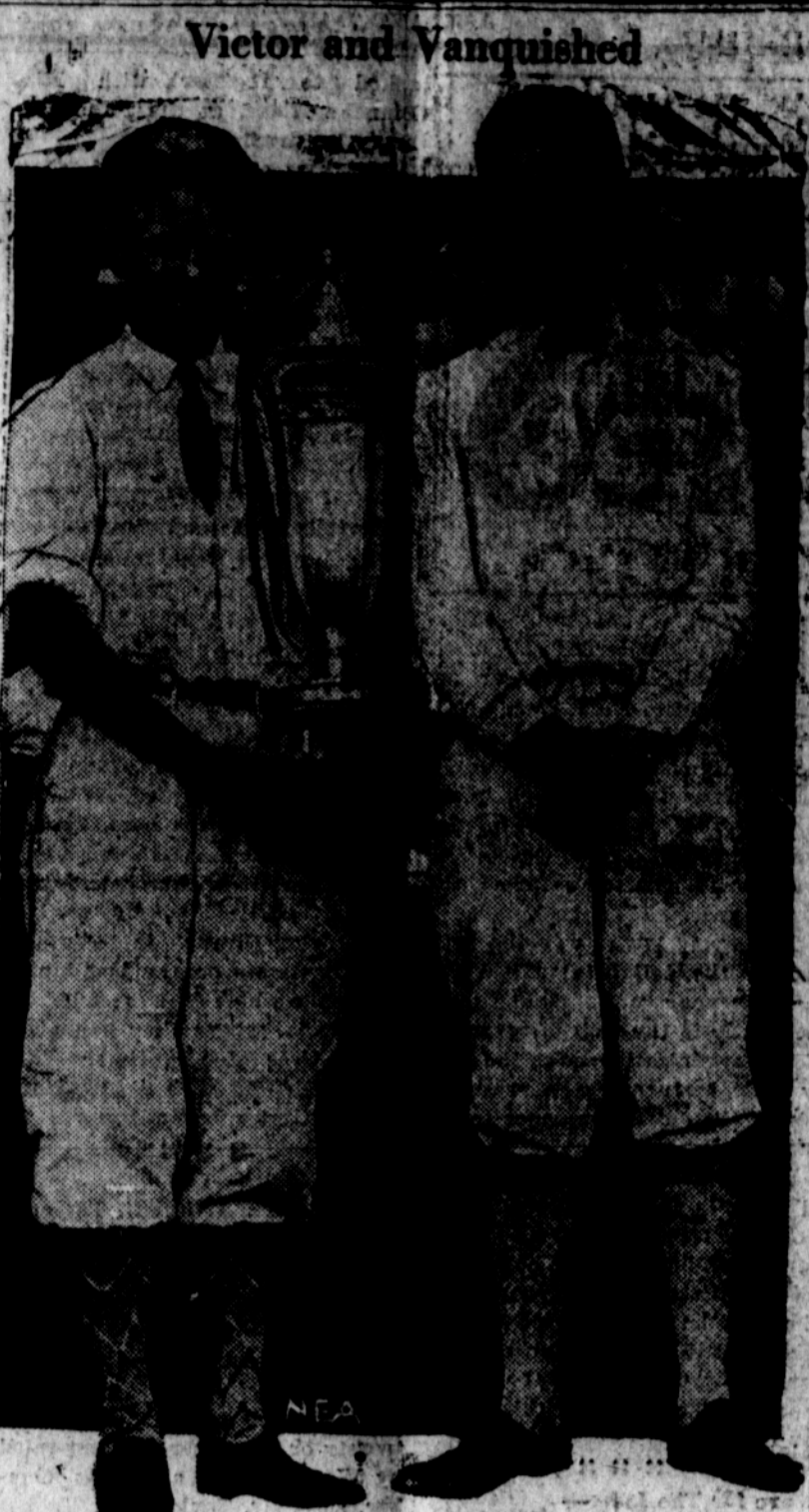
Victor and Vanquished

FOR SALE—Ford Roadster, 6 tires, new top, paint, bands, rings and pistons, late model. Must be sold for cash, $135.00 Come early. Oak St. Garage. 294-3t