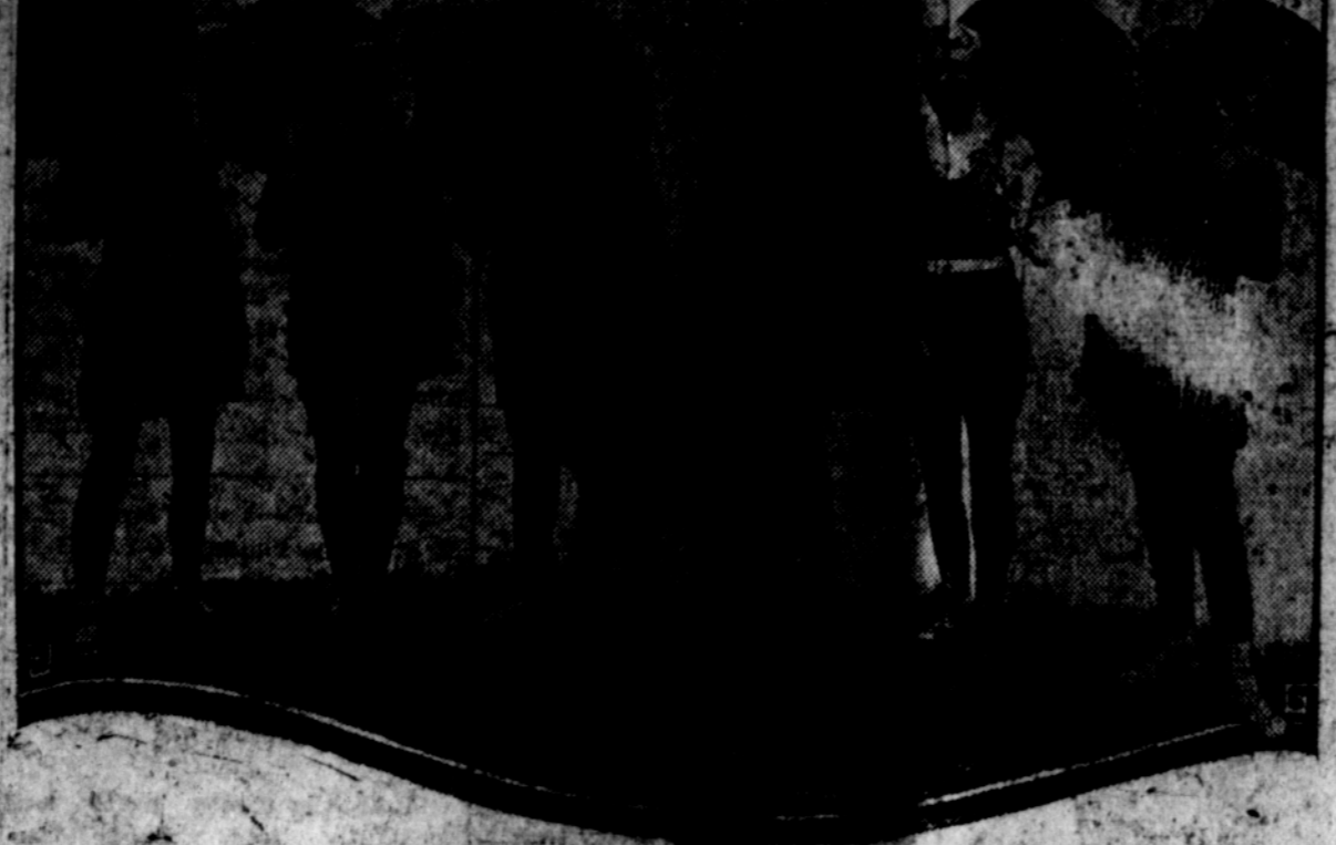
To the American Legion men of Shreveport, La., goes the distinction of holding this country's first male beauty contest. They hired the ball park and set a record of $200,000. Here are some of the entries.