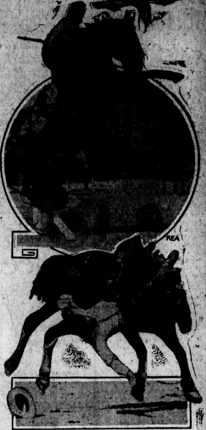
Riding bucking bronchos is a dangerous occupation, as these two unusual photographs, taken at the Winnipeg rodeo, show. Power Kila, shown in the upper picture, was badly injured when the horse fell on him a couple of seconds after the picture was taken, and is now in a hospital. Below, Bobbie Bourie is shown in the air after being thrown by Tumbleweed. He, too, is in a hospital.