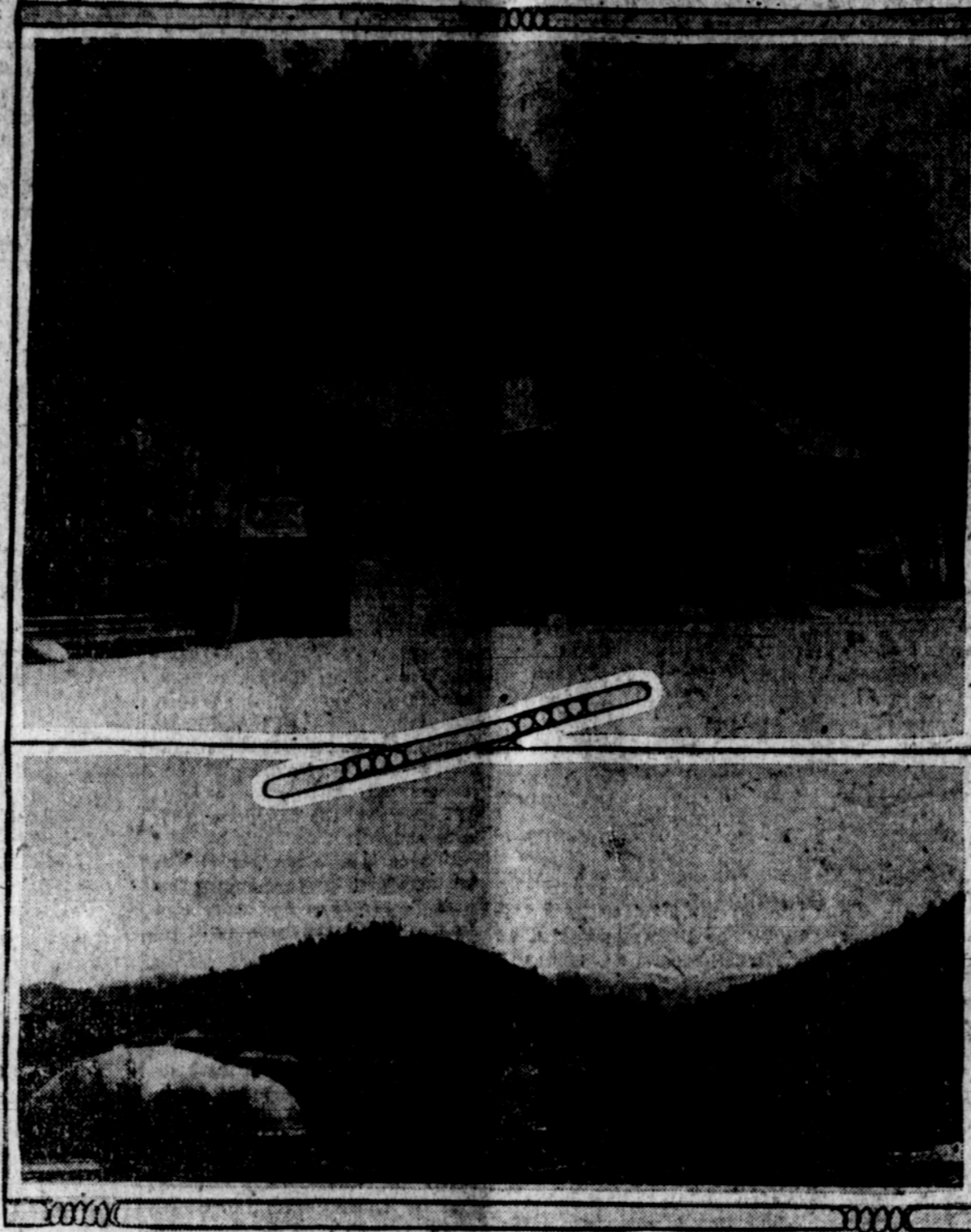
ABOVE—COMMUNITY HOUSE LITHIA PARK BELOW—LOOKING WEST FROM ASHLAND

Crater Lake can be reached from Ashland either through Medford or Klamath Falls. If going in by Klamath Falls the motorist should come out by way of Medford, or vice versa. Both roadways are delightful drives and well worth the time of the tourist and vacationist.