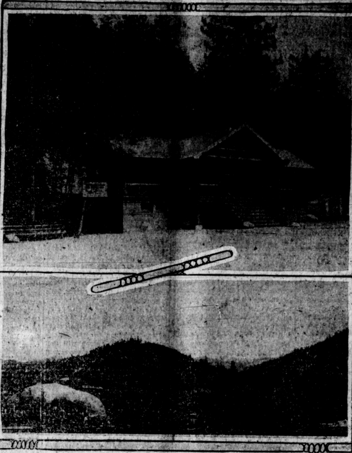
ABOVE—COMMUNITY HOUSE LITHIA PARK BELOW—LOOKING WEST FROM ASHLAND

Crater Lake can be reached from Ashland either through Medford or Klamath Falls. If going in by Klamath Falls the motorist should come out by way of Medford, or vice versa. Both roadways are delightful drives and well worth the time of the tourist and vacationist.