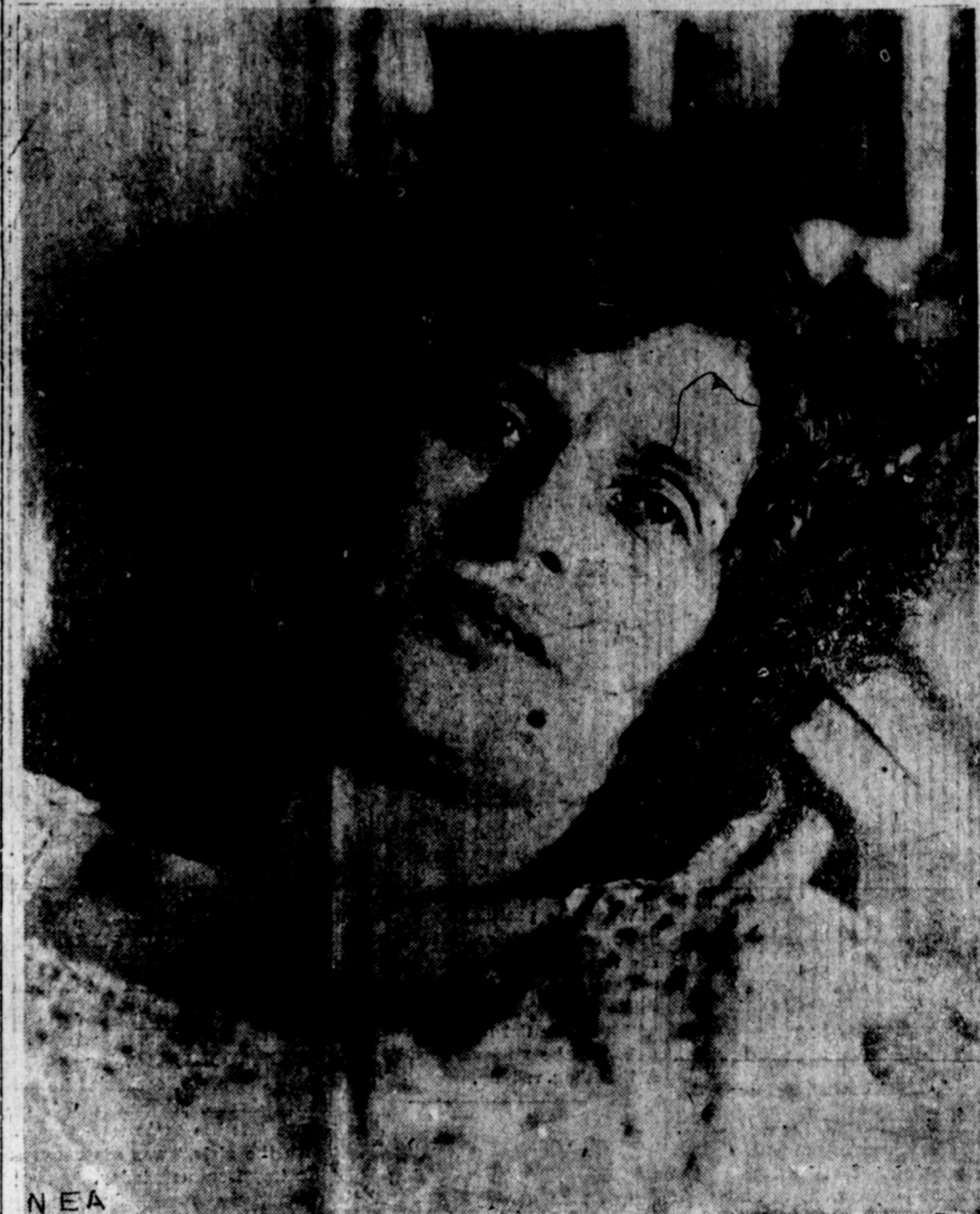
This picture of Aimee Semple McPherson, noted Los Angeles evangelist, taken after her arrival in Douglas, Arizona. Mrs. McPherson, who says she escaped after being held captive by kidnapers, was too weak to sit up and pose for the photographer. She is shown here in her bed in the Douglas hospital.