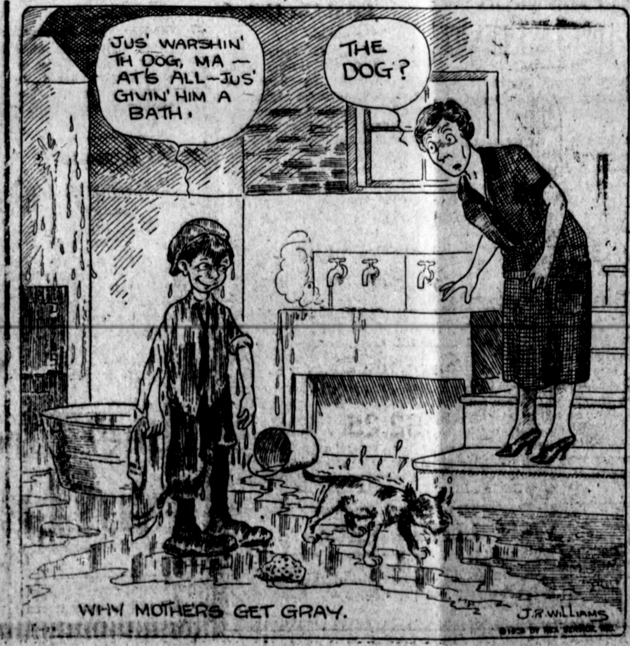
WHY MOTHERS GET GRAY.