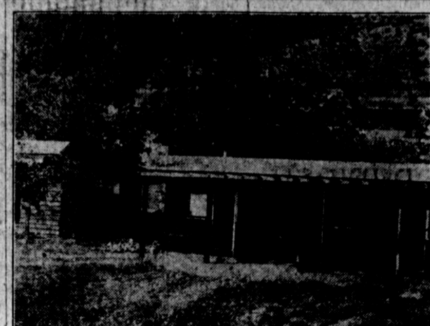
Type of modern tourists' cabins at Lithia Park campgrounds. This and the campgrounds at Jackson Hot Springs, just north of this city, offer the best accommodations for the tourists who want to camp out.