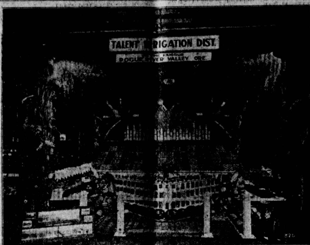
Display of products grown in The Talent Irrigation district, one of the most fertile parts of the Rogue River Valley, where opportunities for settlers offer many inducements.