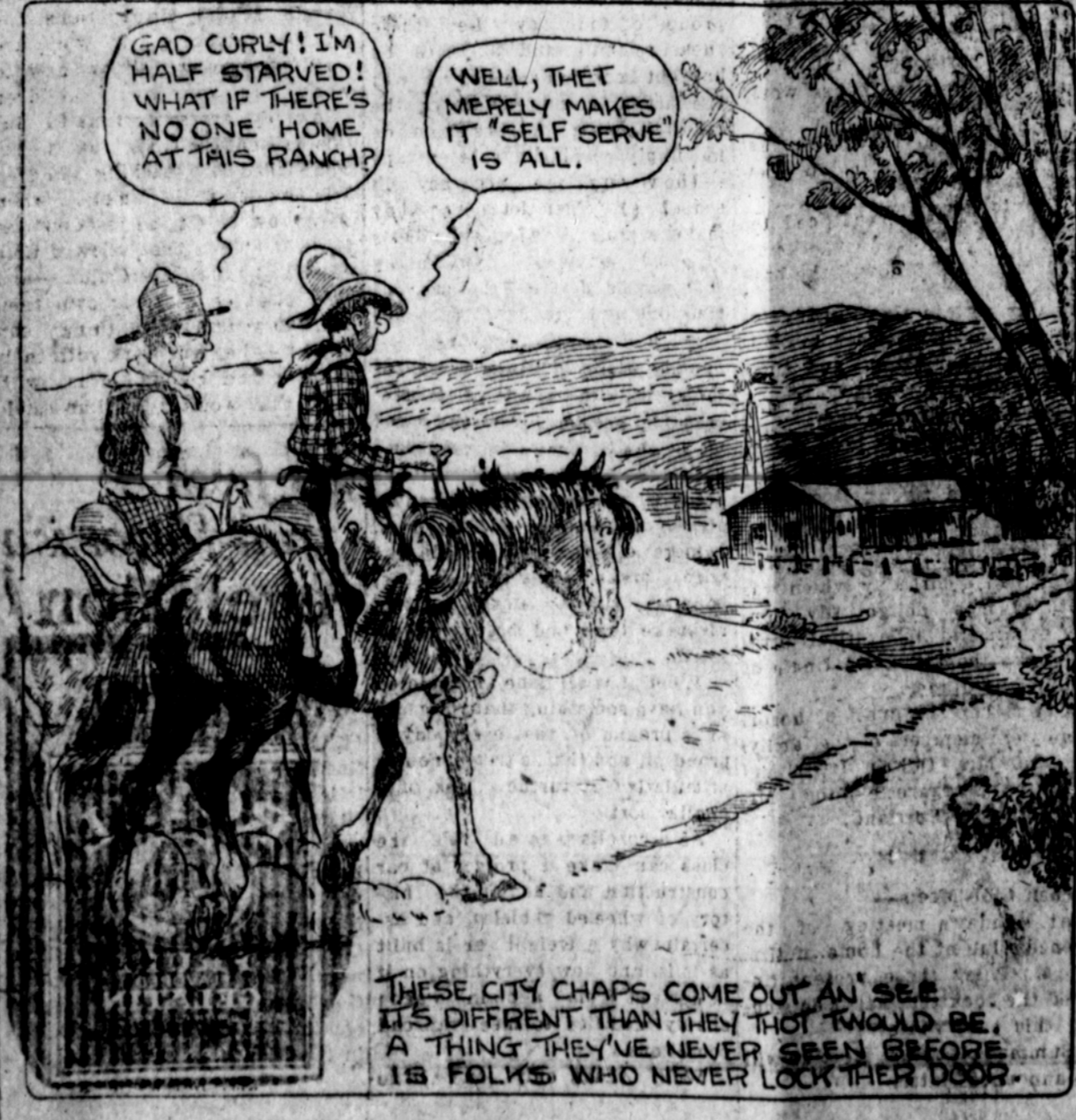
THESE CITY CHAPS COME OUT AN' SEE IT'S DIFFERENT THAN THEY THOUGHT BE. A THING THEY'VE NEVER SEEN BEFORE. IS FOLKS WHO NEVER LOOK THEIR DOOR.