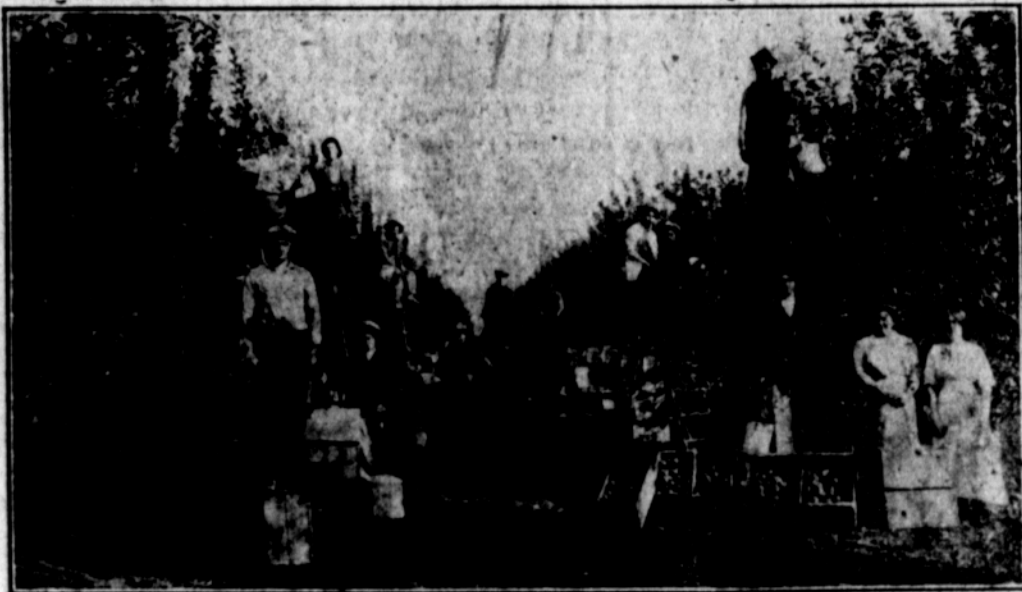
WHERE THEY PICK PEARS BY THE CARLOAD.

POULTRY RAISING — There are wonderful opportunities here for the men who know the poultry business, with the advantages of superior climate.