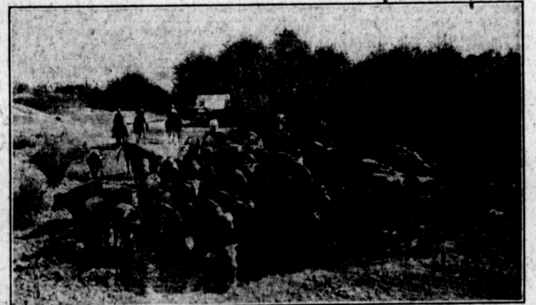
CATTLE THRIVE IN OUR LAND OF SHORT WINTERS.