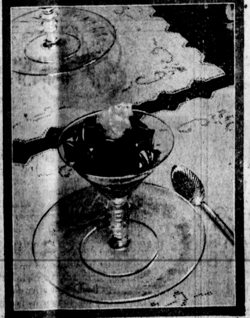
ROYAL STRAWBERRY: "Its flavor is true to the fruit - n. artificial taste at all " writes a delighted woman.

Now it's in your own town, you can buy it today. Royal Fruit Flavored Gelatin comes in five flavors. Strawberry, Raspberry, Cherry - with delicious flavor from the fruit juices. Orange and Lemon with delicious flavor from Oil of Orange and Oil of Lemon.