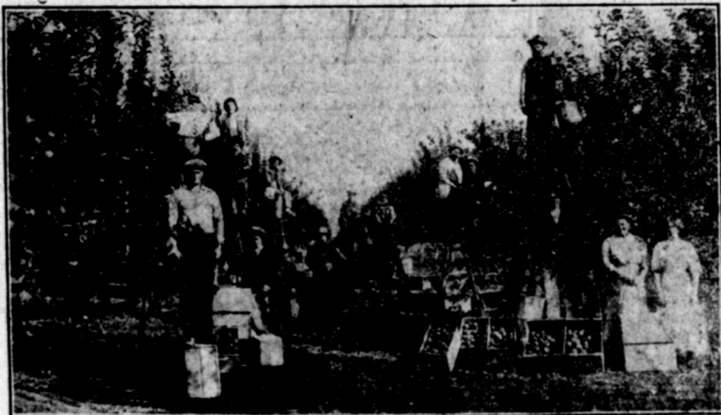
WHERE THEY PICK PEARS BY THE OARLOAD.

POULTRY RAISING — There are wonderful opportunities here for the men who know the poultry business, with the advantages of superior climate.