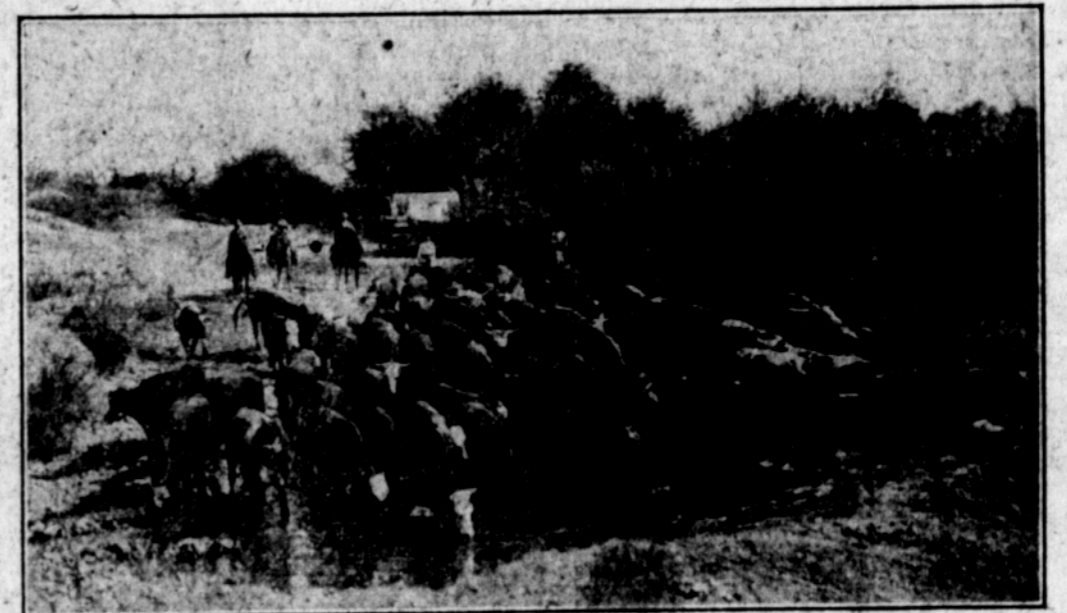
CATTLE ARRIVE IN OUR LAND OF SHORT WINTERS.