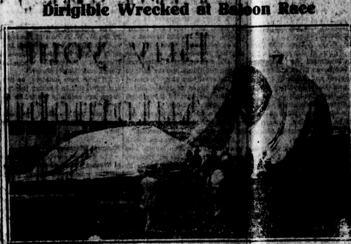
Crowds that gathered at Little Rock, Ark., for the national balloon races got an unexpected thrill when the big army dirigible TC-8 ripped a seam and came down in a heap. The big ship is shown as it looked after the gas bag opened, at the top and let $6000 worth of helium escape. The gaping hole is plainly visible. The crew escaped unhurt.

A photographic system for surveying and measuring land has been invented by a London resident.