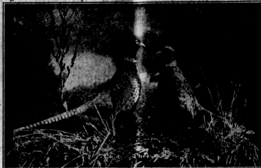
In the fall China pheasant hunting reigns in Oregon. Above are specimens of these game birds which are brought down by the thousands in Southern Oregon.