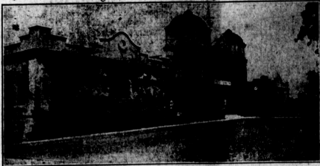
Ashland is noted as a city of homes and schools. Above is the Ashland high school, a modern structure situated in ideal surroundings.