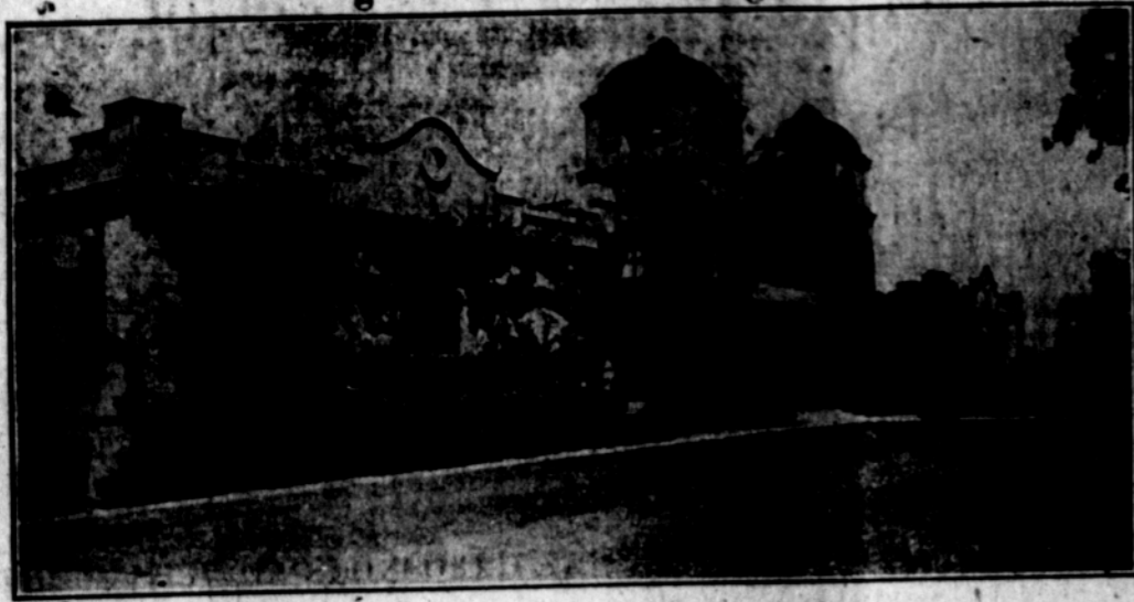
Ashland is noted as a city of homes and schools. Above is the Ashland High School, a modern structure situated in ideal surroundings.