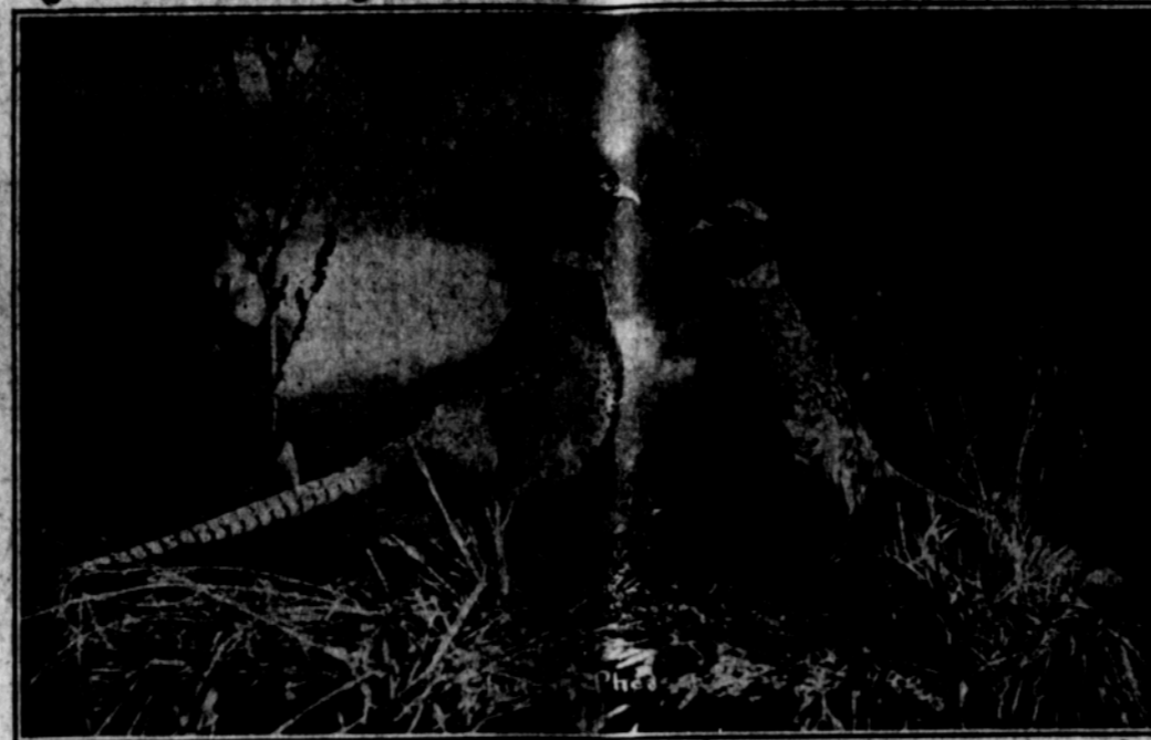
In the fall China pheasant hunting reigns in Oregon. Above are specimens of these game birds which are brought down by the thousands in Southern Oregon.