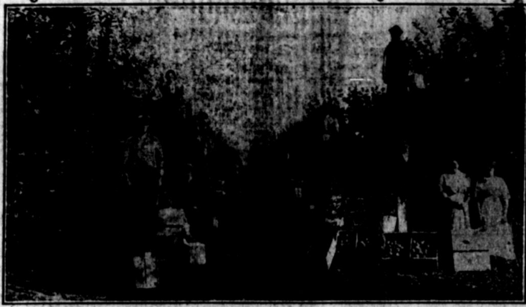
Jackson county pears and other fruits command the top prices the country over. The above depicts an orchard scene during harvest time.

Much of the tourist travel which comes through Ashland during the summer months is either coming from Crater Lake or going to Crater Lake, the west's greatest scenic attraction. Crater Lake Lodge will not be open until July 1, although indications are that the highway will be open to the rim of the lake early next month.