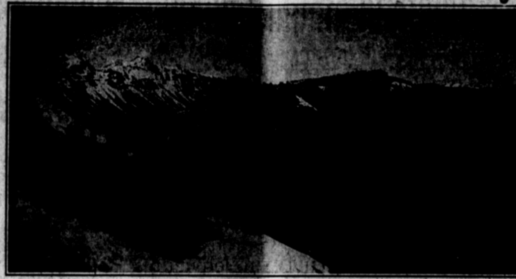
Here is a scene of Wizard Island in Crater Lake, in the country's noted park. Auto tourists can reach Crater Lake National park by two routes from Ashland.

Much of the tourist travel which comes through Ashland during the summer months is either coming from Crater Lake or going to Crater Lake, the west's greatest scenic attraction. Crater Lake Lodge will not be open until July 1, although indications are that the highway will be open to the rim of the lake early next month.