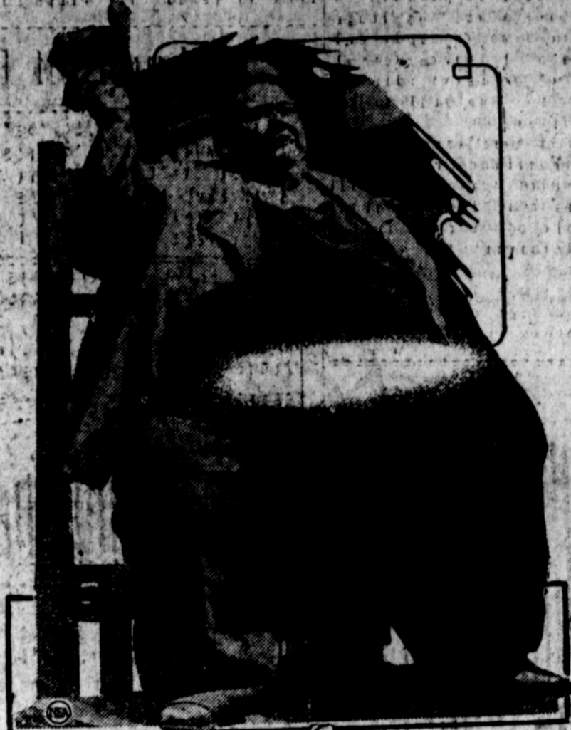
Tom Tom has just reached Chicago from California—the whole 745 pounds. Getting into a berth on the train was out of the question, so he rode in the baggage car, where the porter used half a carload of mattresses to improvise a bed for him.