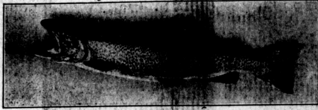
Here is one of the fighting rainbow trout which abound in the myriad of mountain streams adjacent to Ashland and throughout Southern Oregon.