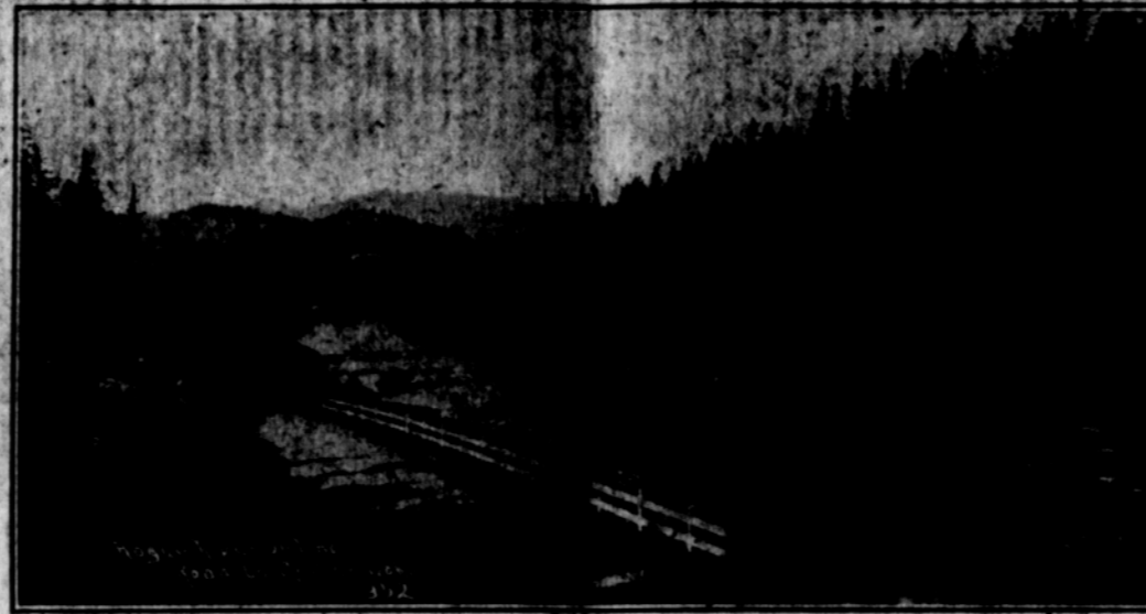
A view of the Rogue river along the highway to Crater Lake National Park.