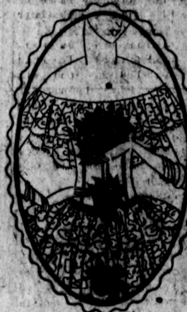
These deep red roses are lovely arranged against the cream satin and delicate lace background of a "Spanish" dress.