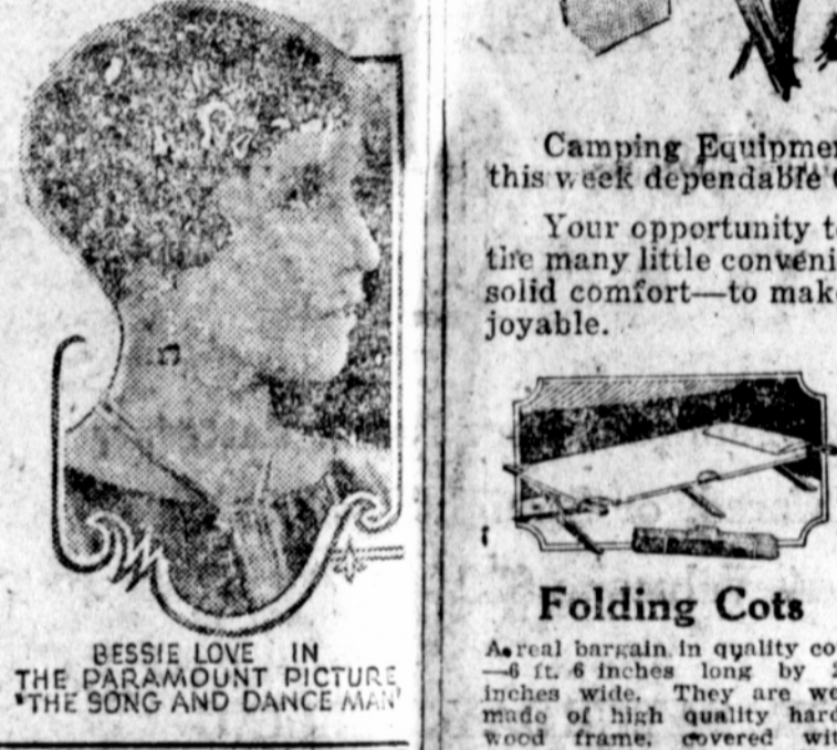
BESSIE LOVE IN THE PARAMOUNT PICTURE "THE SONG AND DANCE MAN"

Oh! Mamma, buy me another one of Parker's Delicious Pop-Corn Crispettes. 191-41