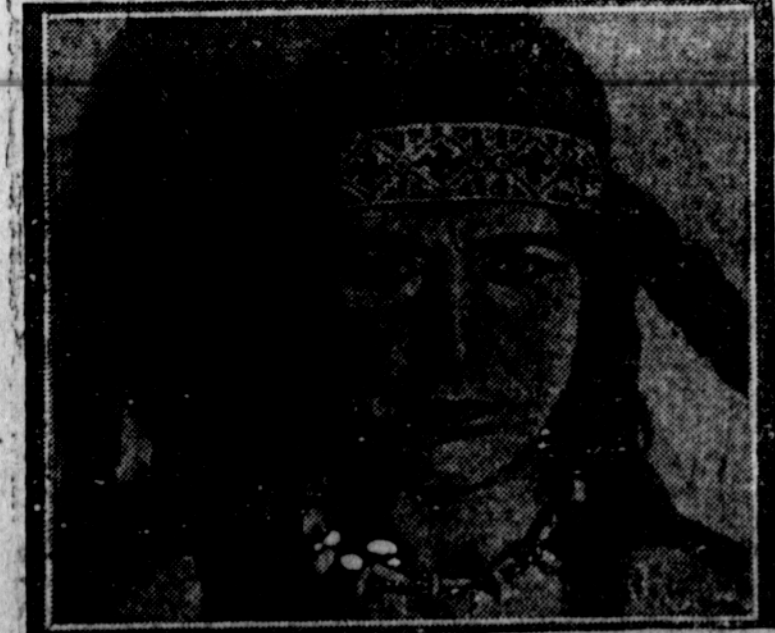
RICHARD DIX IN ZANE GREY'S "THE VANISHING AMERICAN" A PARAMOUNT PICTURE