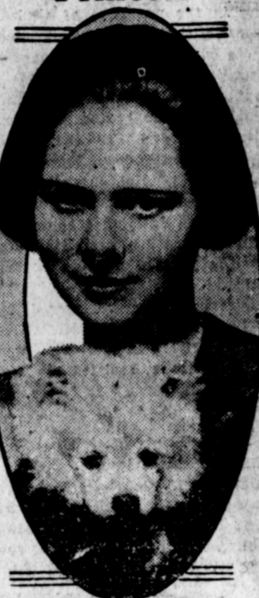
Here is a late photograph of Princess Ileana, youngest daughter of the King and Queen of Rumania. She is only 18.