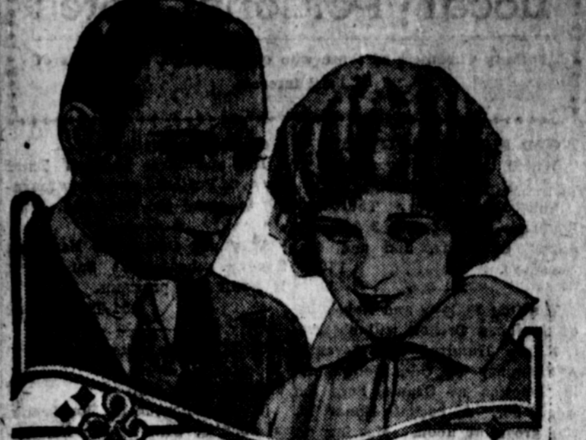
RUDOLPH VALENTINO AND EILEEN PERCY IN THE RITZ-CARLTON PRODUCTION "COBRA," A PARAMOUNT RELEASE AT THE VINING THEATRE ON SUNDAY AND MONDAY.

THE AUTOMOTIVE SHOP Ashland, Ore. QUALITY AT LOW COST