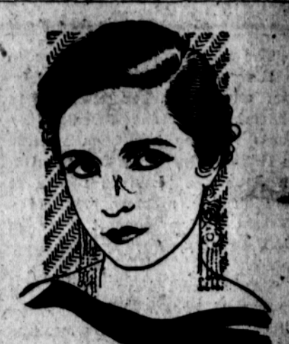
ALICE JOYCE IN THE PARAMOUNT PICTURE "MANNEQUIN"

The geometric beard drawn through this white felt hat is fastened with a rhinestone squirrel.