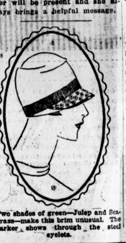
Two shades of green—Julep and Seagrass—make this brim unusual. The darker shows through the steel eyelids.

Billings Agency Estab. 1883 at 41 E. Main St. Real Estate & Real Insurance Phone 211