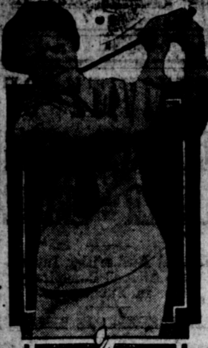
Miss Virginia Van Wie, 17-year-old golfing star who recently defeated Glenna Collett, national women's champion in the finals for the East Coast crown. A few weeks ago, Miss Van Wie won the Florida state title. Miss Collett has been eliminated in one of the earlier rounds. Great things are expected of this latest links sensation.