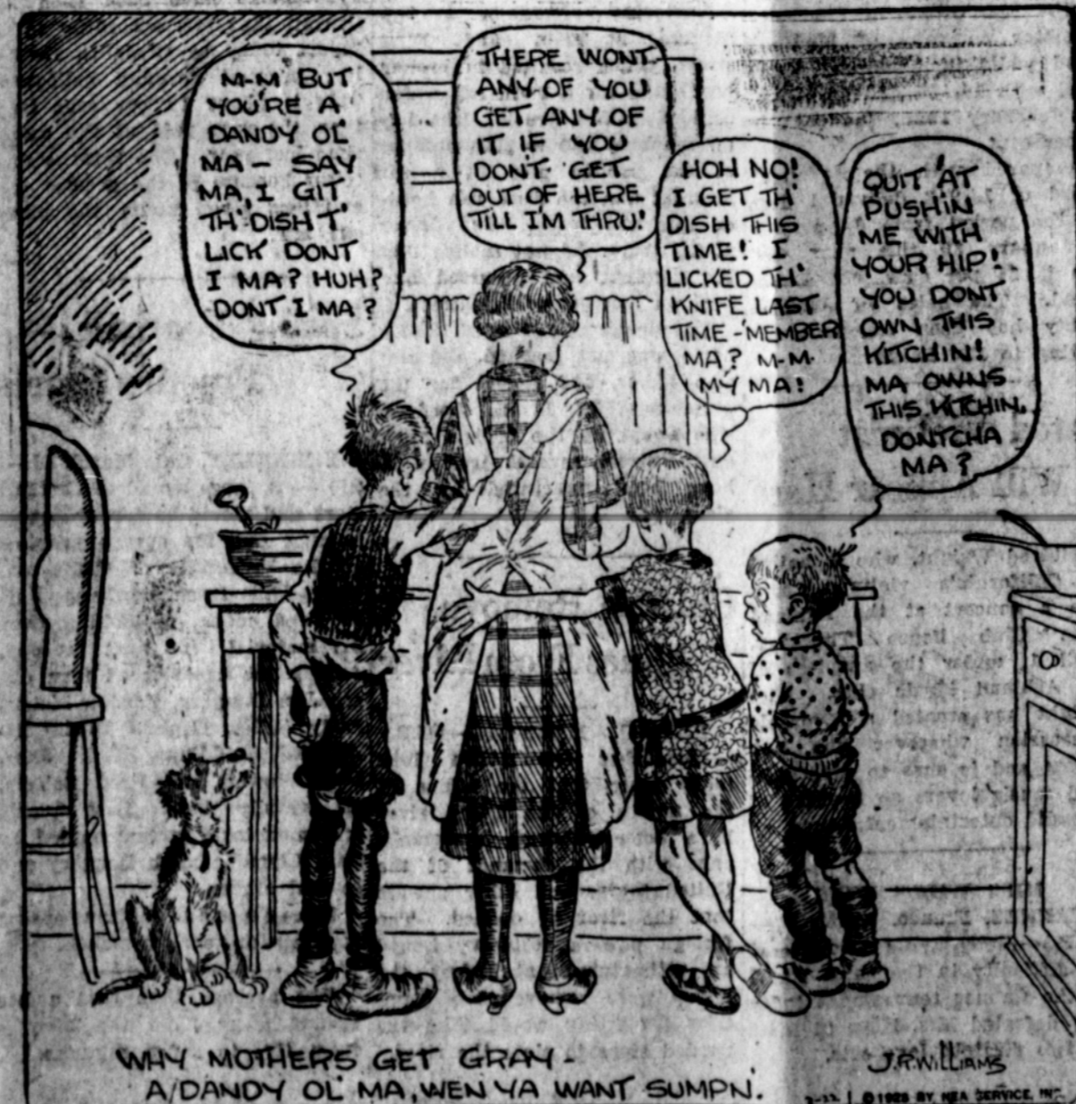
WHY MOTHERS GET GRAY - A DANDY OL MA, WEN YA WANT SUMPN.