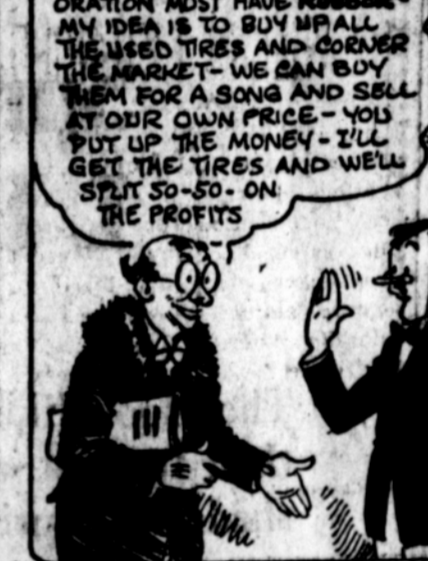
THE RUBBER BRICK CORPORATION MUST HAVE REBORN MY IDEA IS TO BUY UP ALL THE USED TIRES AND COVER THE MARKET—WE CAN BUY THEM FOR A SONG AND SELL AT OUR OWN PRICE—YOU PUT UP THE MONEY—I'LL GET THE TIRES AND WE'LL SPLIT 50-50 ON THE PROFITS.