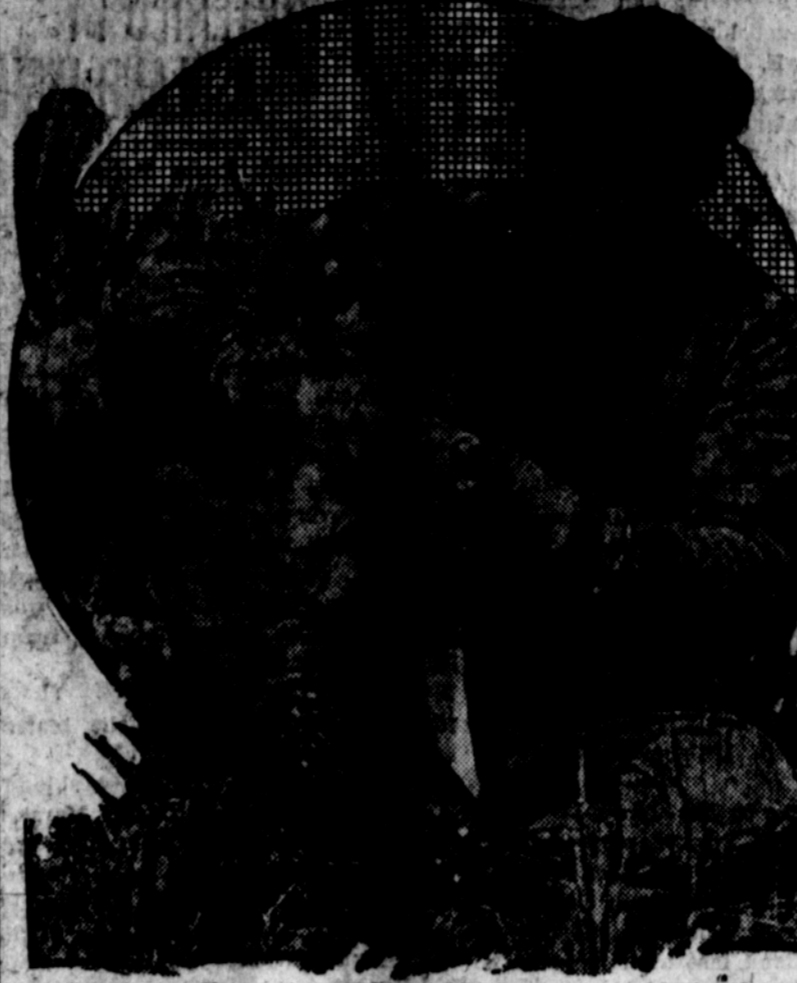
Ty Cobb, famous player-pilot of the Detroit Tigers, keeps in shape during the off-season. One of his favorite sports is hunting. Here he's shown handling the paw of his pet dog after it had picked up a bribe.