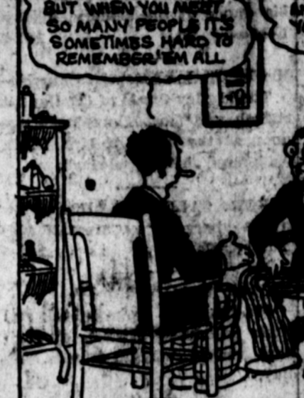
HA—THAT'S FUNNY, BUT WHEN YOU MEET SO MANY PEOPLE IT'S SOMETIMES HARD TO REMEMBER 'EM ALL.