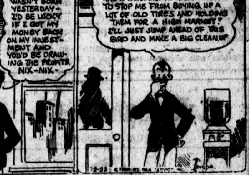
MR. TYTE I'VE GOT AN IDEA FOR CLEANING UP A FORTUNE—READ THIS NEWS ITEM AND THEN I'LL EXPLAIN MY PROPOSITION.