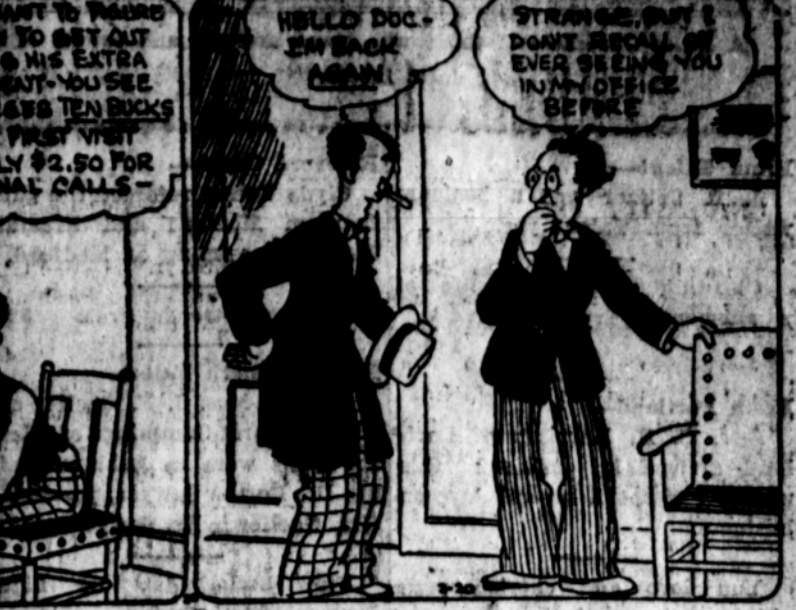
HELLO DOC—HOW ARE YOU?