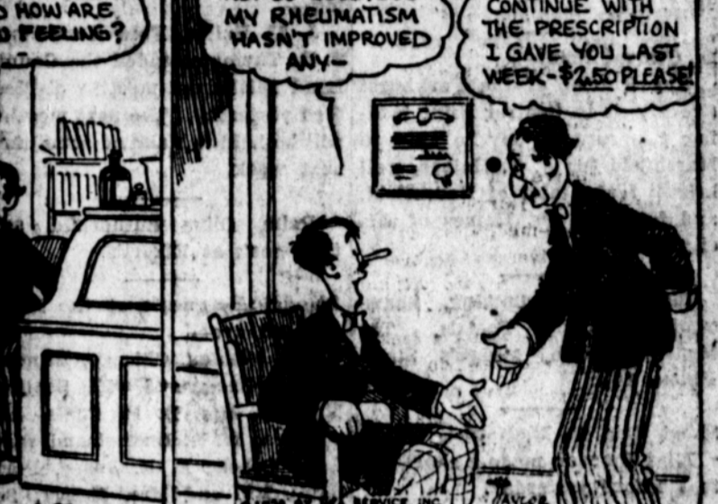
NOT SO GOOD, DOC—MY RHEUMATISM HASN'T IMPROVED ANY—