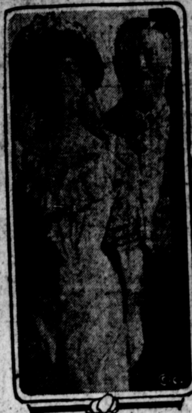
Alice Roosevelt Longworth and her father, the late President Roosevelt, on her wedding day—the time she began her ban on "frumpish" society affairs.