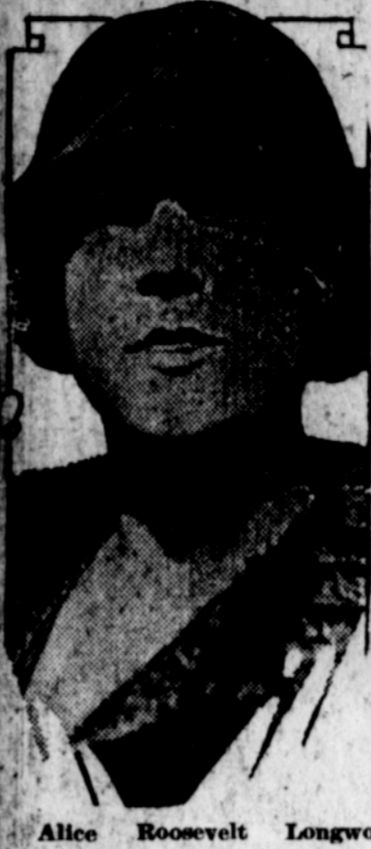
Alice Roosevelt Longworth as she looks today. In the center is baby Paulina Longworth, who is credited by one clique of the Washington elite with causing her to abandon her society policy of 20 years.