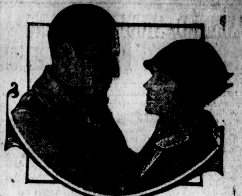
JACK HOLT AND FLORENCE VIDOR IN "THE ENCHANTED RIVER" BY PETER B. KYNE. AN IRVING WILLAT PRODUCTION. A PARAMOUNT PICTURE.