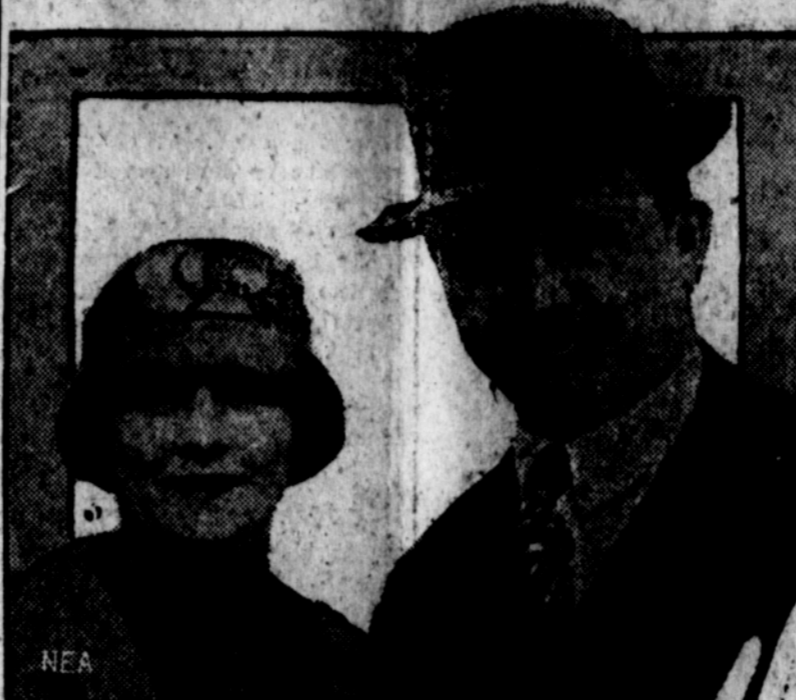
Barney Oldfield, famous auto race driver, and his bride, photographed as they sailed from Los Angeles for Panama and Havana on their honeymoon.