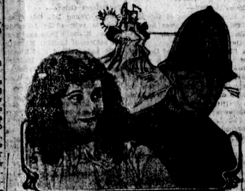
BETTY BRONSON AND TOM MOORE IN JIM BARRIE'S 'THE WINNING FRIDAY AND SATURDAY' A HERBERT BRENON PRODUCTION A PARAMOUNT PICTURE AT THE VINEY FRIDAY AND SATURDAY

Send this ad and ten cents to Foley & Co., 2825 Sheffield Ave., Chicago, Ill., writing your name and address clearly. You will receive a ten cent bottle of FOLEY'S HONEY AND TAR COMPOUND for coughs, colds and hoarseness, also free sample packages of FOLEY PILLS, a diuretic stimulant for the kidneys, and FOLEY CATHARTIC TABLETS for Constipation and Biliousness. These wonderful remedies have helped millions of people. Try them—Sold everywhere.