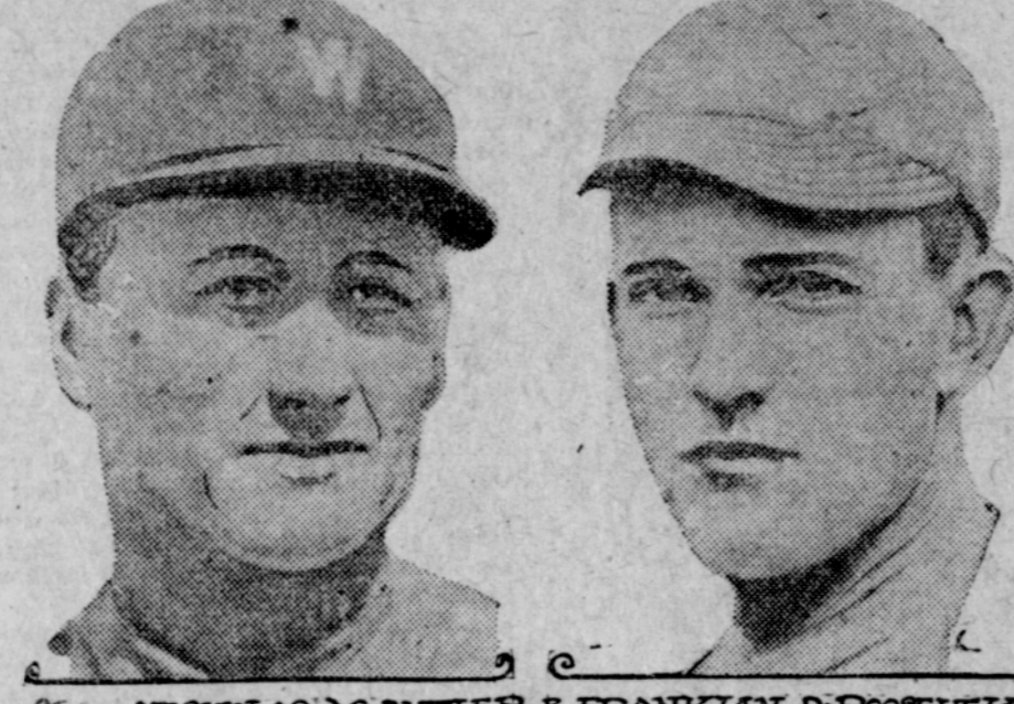
Below: NICHOLAS M. BUTLER & FRANKLIN D. ROOSEVELT. Below: WALTER JOHNSON & ROBERT HORNBY.

Nicholas Murray Butler, president of Columbia University, New York City, and one of America's foremost educators, has undergone an operation there for glaucoma of the right eye, a disease affecting the eyeball. A boom has been launched in the South for the nomination, four years hence, of Franklin D. Roosevelt of New York as the Democratic candidate for the Presidency. Rogers Hornby, star second baseman for the St. Louis Cardinals, has signed a three-year contract at a salary of $33,333.33 a year. Walter Johnson, star pitcher of the world champion Senators, has given up his efforts to buy a Pacific Coast club and will pitch again for Washington.