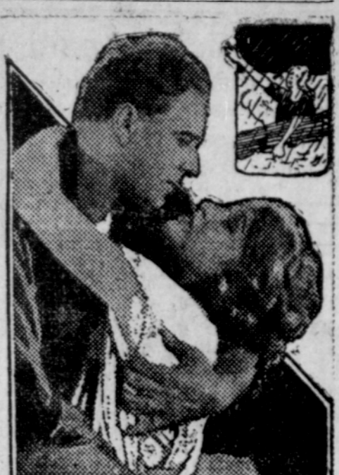
Scene from "THE TORNADO" Starring HOUSE PETERS' "UNIVERSAL SEWEL"