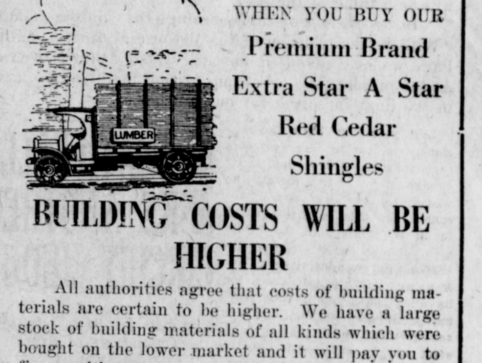
figure with us on your new or repair work. We have quick delivery service ASHLAND LUMBER COMPANY

Eugene - Full-time construc-The present minister has been tion on Southern Pacific Natron etained for another year at a subcut - off should be possible March 1.