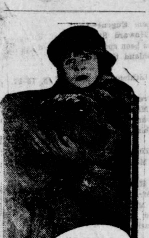
JACKIE COOGAN in 'A BOY OF FLANDERS' At the Vining today & tomorrow

Lady: "You look able to work." Tramp: "Mebbe so, mum. But I ain't as foolish as I look."