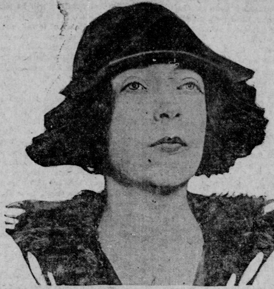
MRS. NICHOLAS LONGWORTH, WIFE OF CONGRESSMAN NICHOLAS LONGWORTH, OF CINCINNATI, O., DAUGHTER OF THE LATE COLONEL THEODORE ROOSEVELT, HAS ARRIVED IN CHICAGO, WHERE ELABORATE PREPARATIONS WERE MADE FOR HER FIRST VISIT FROM THE STORK. THIS PHOTOGRAPH WAS TAKEN UPON HER ARRIVAL IN THE WINDY CITY.