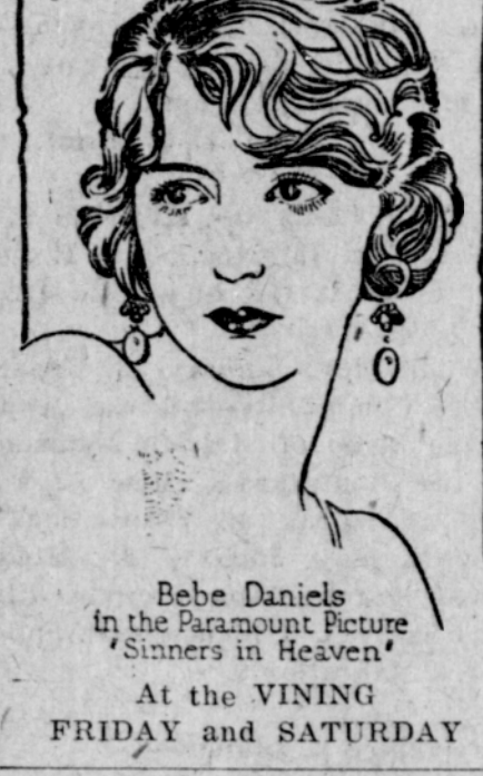
Bebe Daniels in the Paramount Picture "Sinners in Heaven" At the VINING FRIDAY AND SATURDAY

Monmouth — Completion and dedication of section of West Side highway gives first unbroken paved road across Oregon.