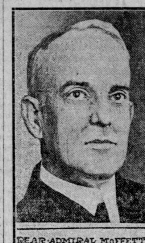
Rear Admiral Moffett

Of the 310 planes of all types in possession of the United States Navy, only 244 can be used effectively in the event of war. Rear Admiral W. A. Moffett, Chief of the Bureau of Aeronautics, told the Special Aircraft Investigating Committee of the House.