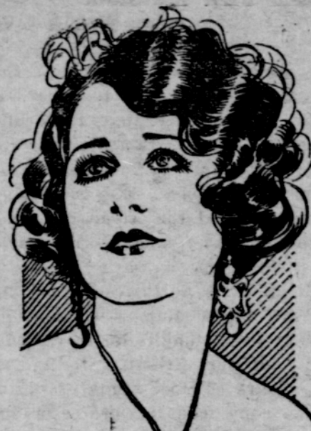
Norma Shearer in the Paramount Picture "Empty Hands" At the VINING—TODAY and TOMORROW