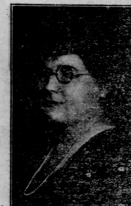
CANDIDATE CORONER Nov. 4, '24 Independent

Ashland - Talent irrigation dam will add 8,000 acre feet water for storage and will cost $320,000. Jackson county now has 60,000 acres irrigated land. on face, neck, arms or body is