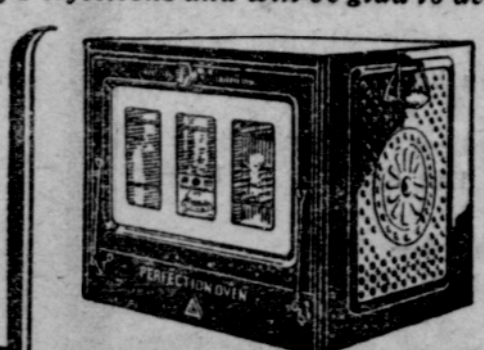
For best results use Perfection Ovens on Perfection Stoves. All styles and sizes.