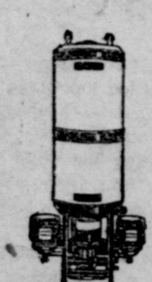
For quick, abundant hot water without gas, get a Perfection Kerosene Water Heater.