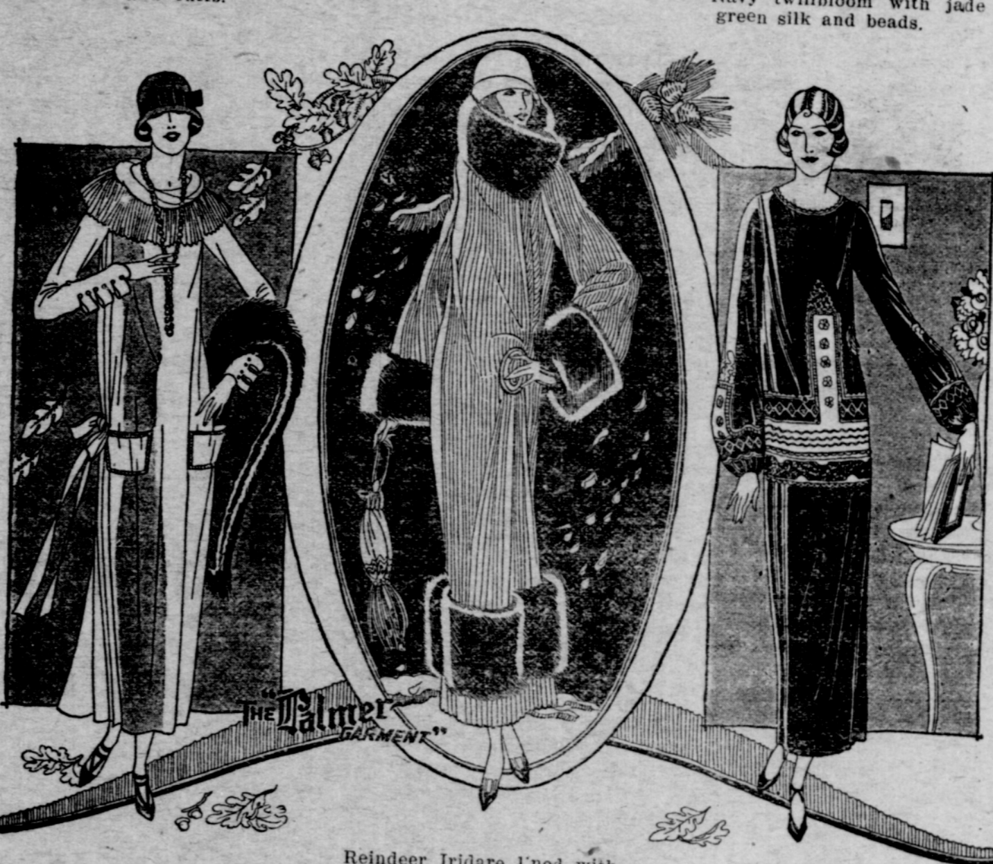
Navy twill bloom with jade green silk and beads.