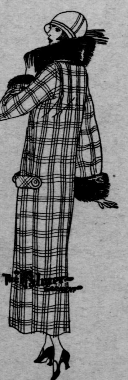
Tan border coating and milk marmot.