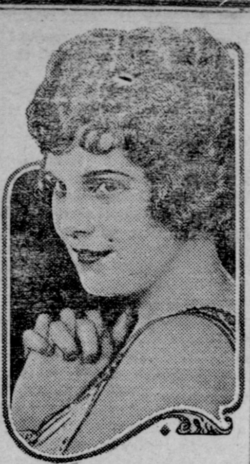
Leatrice Joy in 'The Marriage Cheat'

Estab. 1883 Real Estate & Real Insurance 41 E. Main St. Phone 211