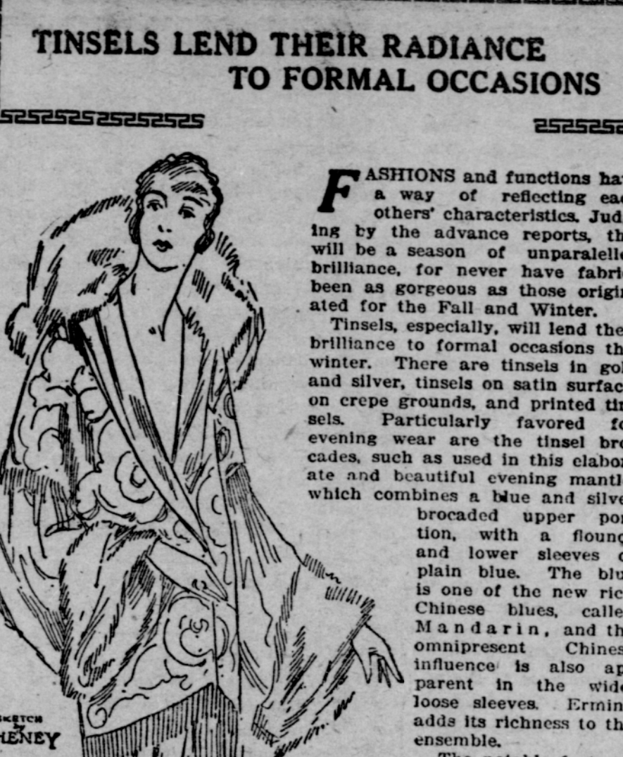
Leatrice Joy in 'The Marriage Cheat'

FASHIONS and functions have a way of reflecting each others' characteristics. Judging by the advance reports, this will be a season of unparalleled brilliance, for never have fabrics been as gorgeous as those originated for the Fall and Winter. Tinsels, especially, will lend their brilliance to formal occasions this winter. There are tinsels in gold and silver, tinsels on satin surface, on crepe grounds, and printed tinsels. Particularly favored for evening wear are the tinsel brocades, such as used in this elaborate and beautiful evening mantle, which combines a blue and silver brocaded upper portion, with a founce and lower sleeves of plain blue. The blue is one of the new rich Chinese blues, called Mandarin, and the omnipresent Chinese influence is also apparent in the wide, loose sleeves. Ermine adds its richness to the ensemble.