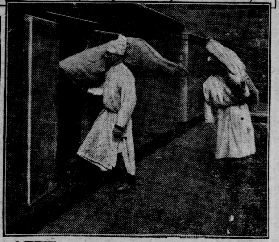
Loading Meats into Refrigerator Cars

They make possible the movements of large quantities of meat from regions where production exceeds consumption into other regions where supply is inadequate. Otherwise industrial development in the east would not have been possible. According to the census figures, the center of human population is in Western Indiana, a little southwest of Indianapolis; that of cattle is in western Kansas; of sheep in western Nebraska near the Colorado State line. The center of swine population is in Missouri, and of dairy cattle in western Illinois. This situation in America is entirely different from that in Europe where regions of large consumption of farm products are never far removed from regions of agricultural production, and where