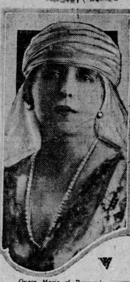
Queen Marie of Romania. A distinguished example of the beauty and dignity of the mature woman.

TO look younger than one's age is not necessarily to look more attractive. Each age has its own fascination, and to jettison the charm of maturity for the Fata Morgana of a spurious youthfulness is to sell one's own birthright. But, to make the most of this rare charm, a certain amount of wisdom must be acquired in the use of adjuncts to beauty.