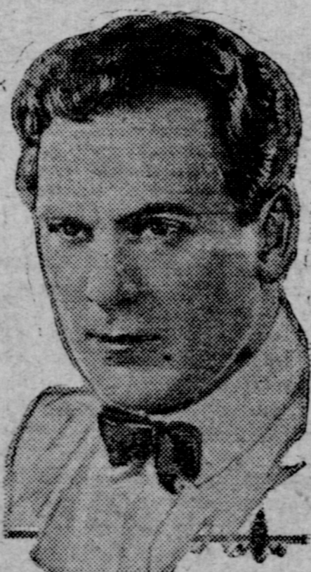
Thomas Meighan in the Paramount Picture "The Confidence Man"

A huge parade of school children will be divided into costumed groups representing 54 nations which now are members of the league. All the children will carry American flags and the American minister to Switzerland and members of his staff will attend the dedication ceremony of a tablet overlooking the promenade and the lake.