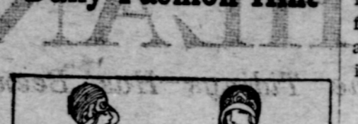
UNQUESTIONABLY CORRECT SPORTS MODELS

Either of these frocks would add to the delight of a day devoted partly to outdoor exercise, yet they are as appropriate for women of less energetic activities.