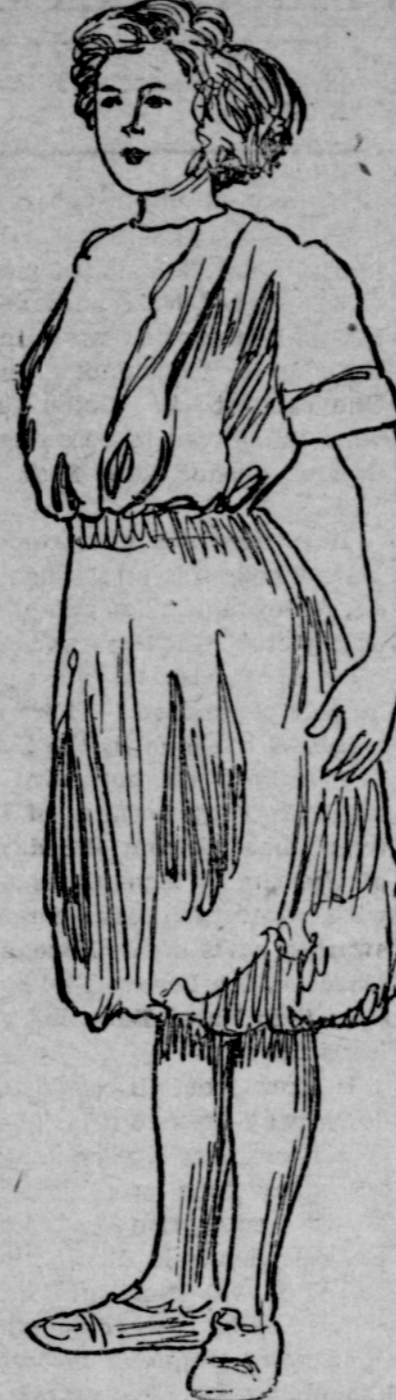
(c) By Bernard Macfadden From sides bring arms straight forward on a level with shoulders then return to original position. Keep elbows rigid. Count 1-2.