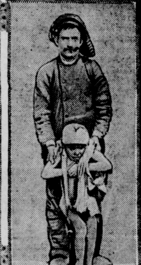
This little boy was carried to a Presbyterian Mission Hospital in Ferria and has since become a normal healthy lad.

Just when a stricken world is looking most expectantly toward America and relief comes the report that one of the oldest and most widely spread humanitarian agencies of the United States is in imminent danger of having to curtail or even abandon much of its work in foreign lands.