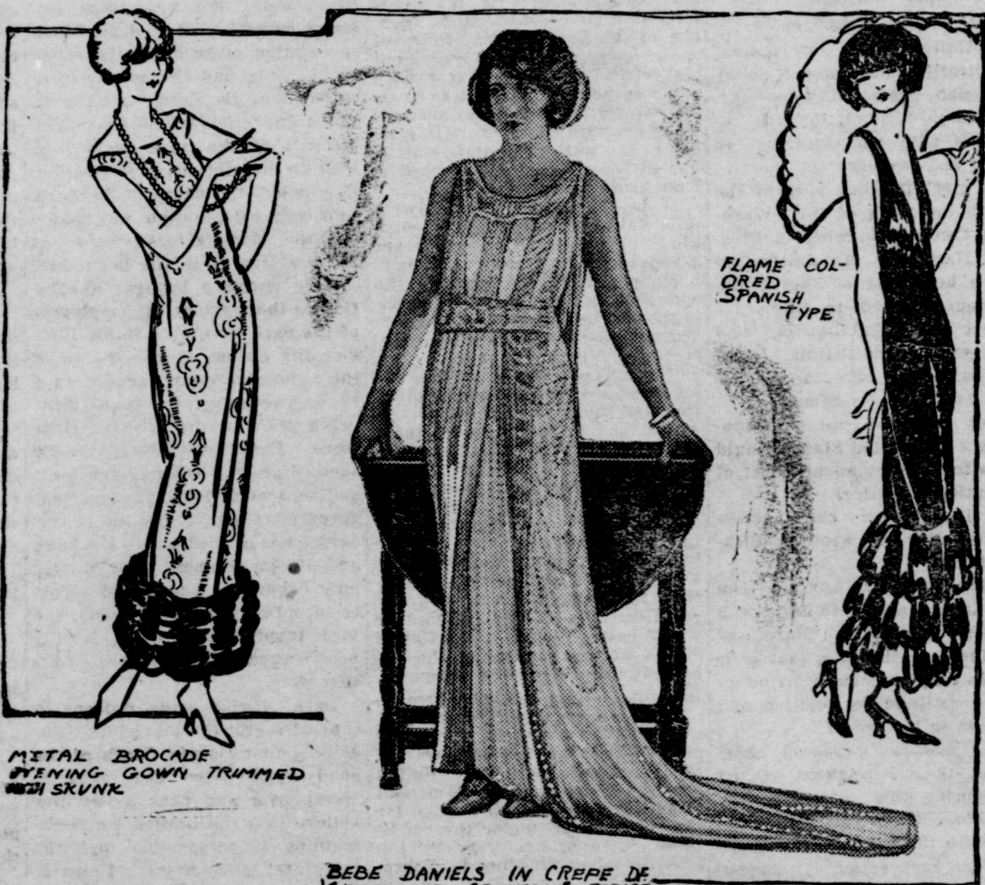
METAL BROCADE EVENING GOWN TRIMMED WITH SKUNK